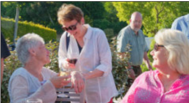
Ladies at the Waie before the tree planting