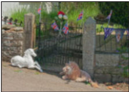
Above:; Yew Tree, Gissage Hill, Below: West Waie