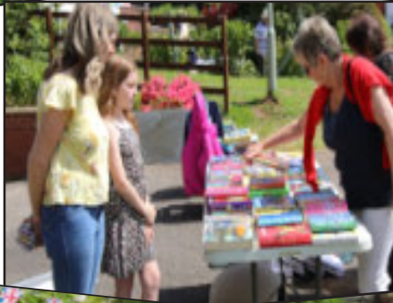
2 Churchill Gardens