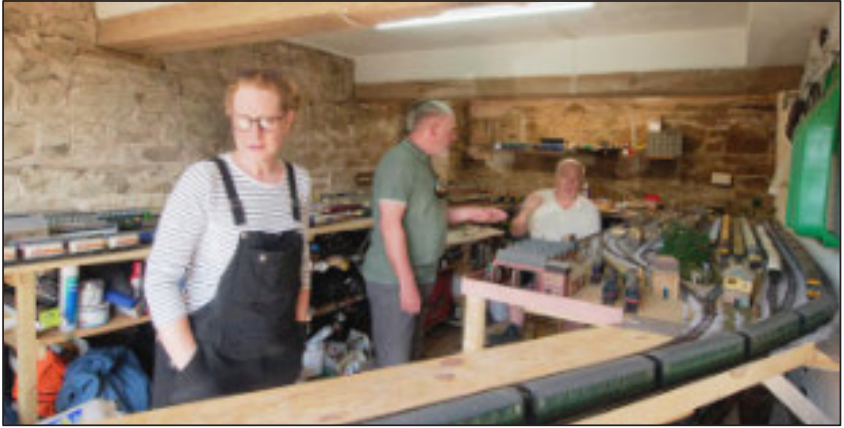
Bramble Junction