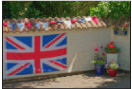
Above: Beam Ends, Western Rd, (MR) Below: Rose Cottage, Western Rd, (DB)