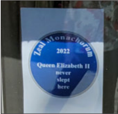
Poster seen in the window of Wallens, as if....