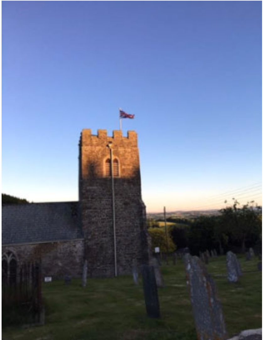
St Peter's Church at dusk on the Jubilee Bank Holiday