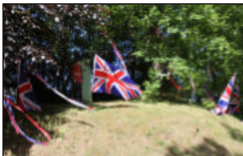
Left: Monkscroft, Western Rd (MR) Top right: Barons Wood - Special Commendation (DB) Bottom Right: 6 Western Road, Runner up, (DB)