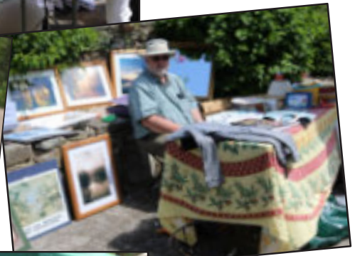
Yew Tree Cottage