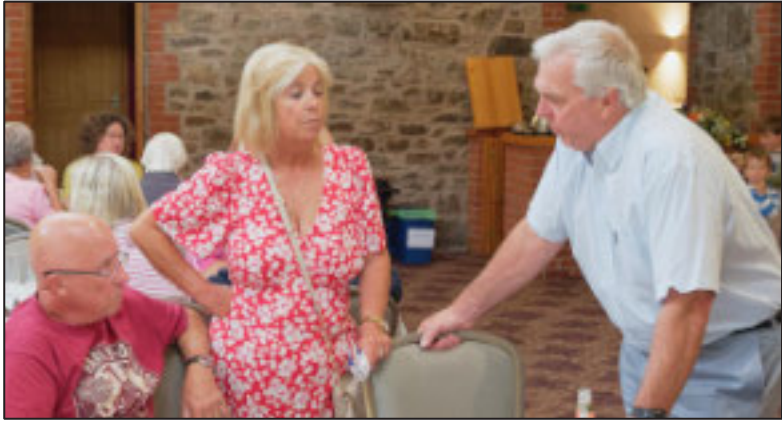
Serious conversation at the Street Party