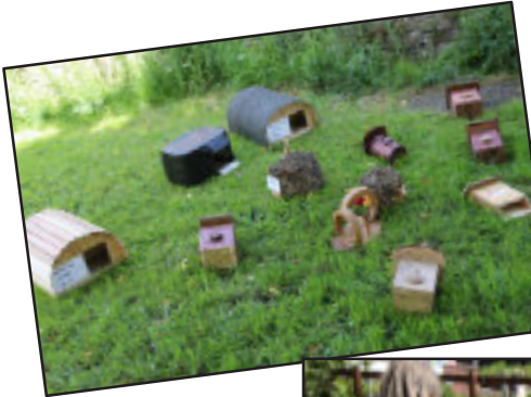
Hedgehog boxes at the Church Sale