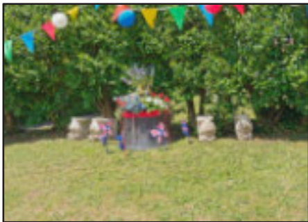
Above: Rowans, Western Rd, Below: Kentmere, Waie Gdns