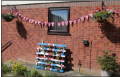
Above: 1 Churchill Gardens Below: Oldlands, Western Rd